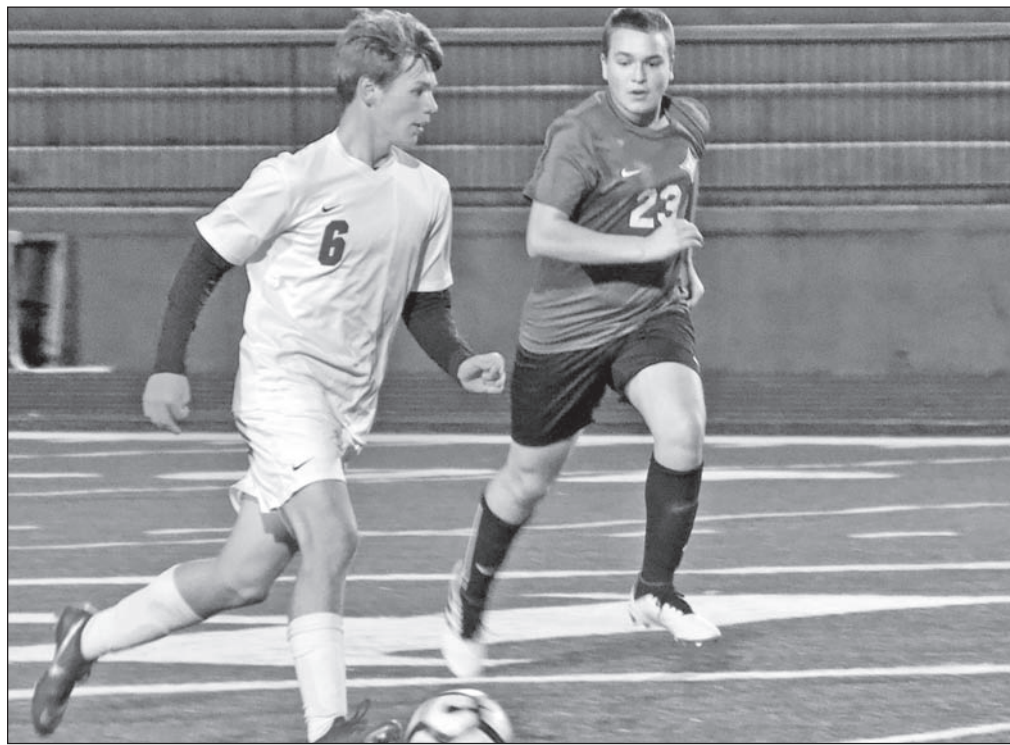
Towns County Indians and Lady Indians soccer photos by Chad Stack

The team had a match after press time on Tuesday,