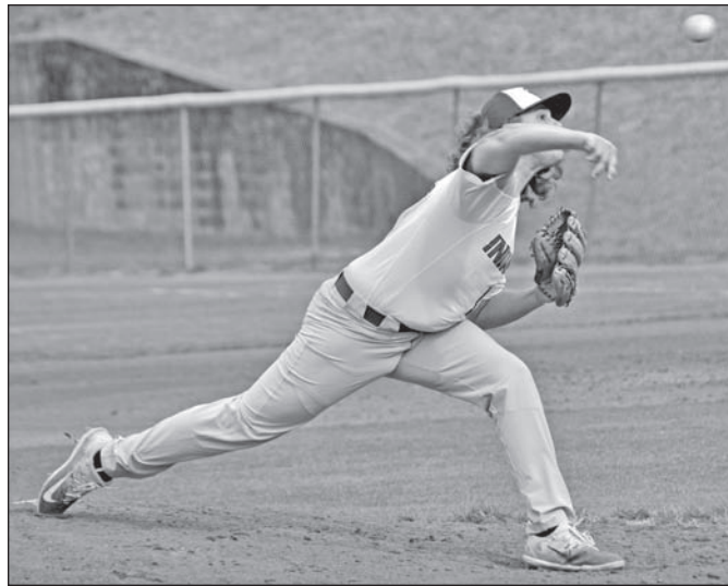
Towns County baseball